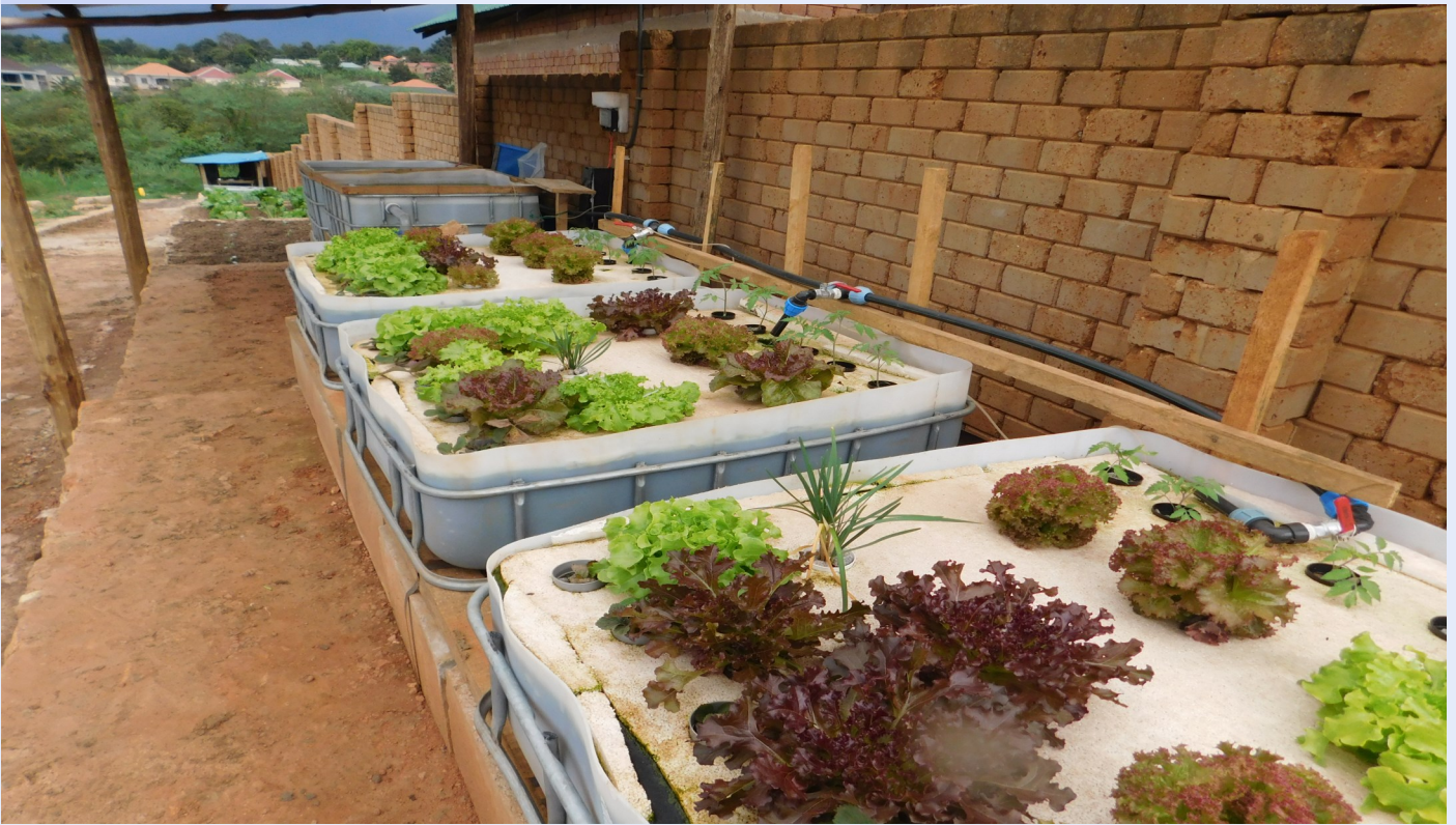
Plastic Aquaponics Unit with Vegetable production at Kyanja ARC