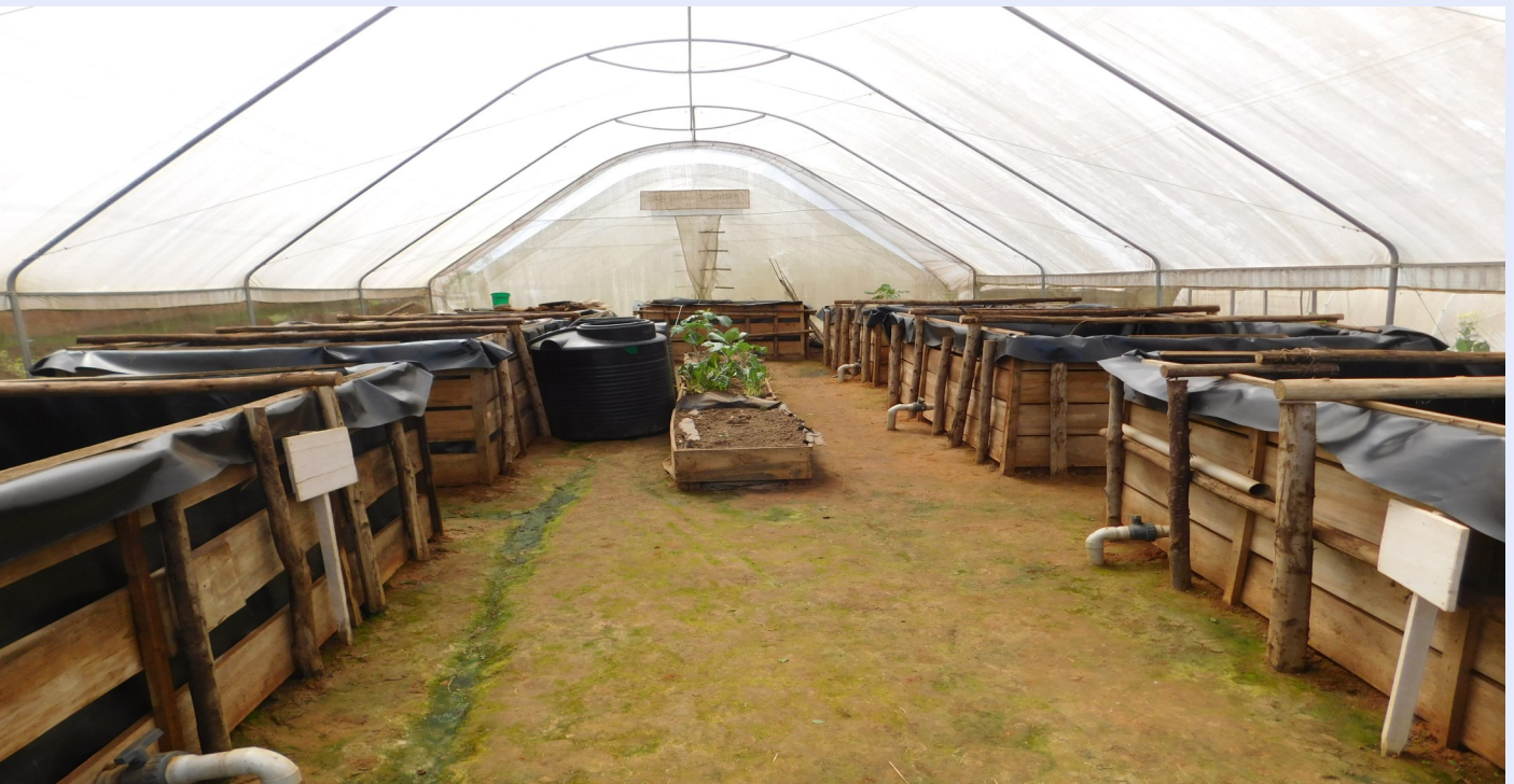
Wooden Fish Tanks at Kyanja ARC

Visit us at KCCA Kyanja Agricultural Resource Centre Off Gayaza Rod Tel. 0794661234/ 0794661258